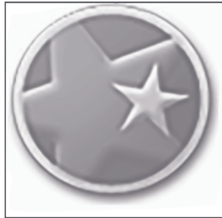
AzMERIT Secure Browser Icon

Before students arrive to take an AzMERIT CBT, the Test Administrator should close all programs on each testing device, then launch the secure browser by clicking the AzMERIT Secure Browser icon.