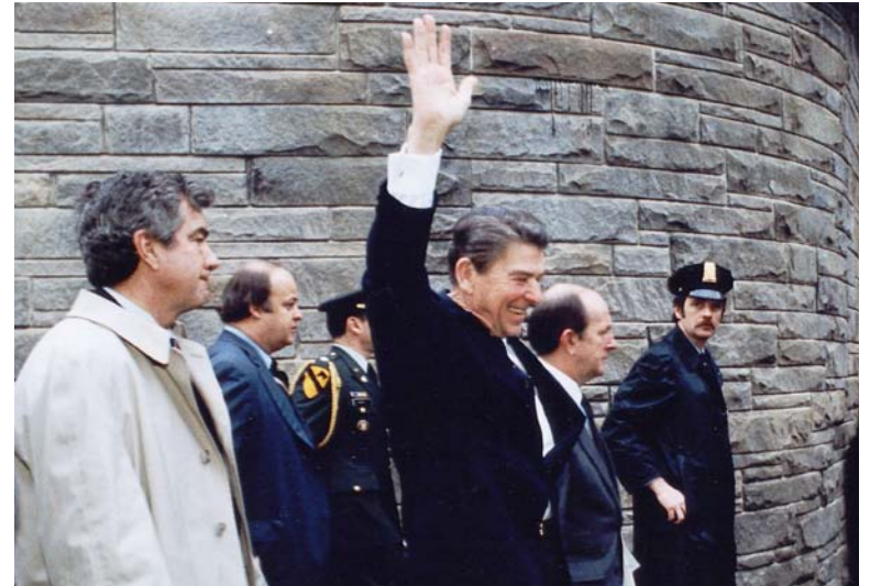
President Ronald Reagan waves to the crowd just moments before being shot on March 30, 1981.

The new president smiled as he walked down Pennsylvania Avenue to the White House. He held hands with the First Lady , Michelle Obama. The couple waved to the cheering crowd. Nearby, groups of men and women dressed in dark suits, some wearing sunglasses, moved along with the couple. Unlike most people in the crowd, these individuals were not looking at the new president and First Lady. Instead, their eyes were searching the crowd of people lining the street, looking for any hint of danger. These men and women were agents of the U.S. Secret Service.