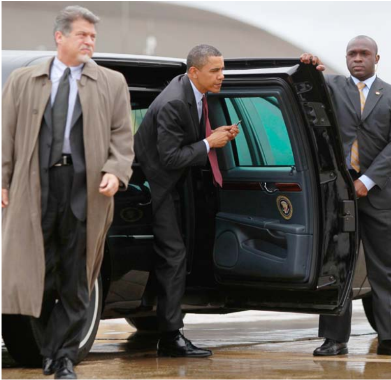
The door of "The Beast" reveals its thick armor.

Agents even built the president a new car, which they nicknamed "The Beast." It looked like a black limousine , but it was really a tank. Its eight inches of armor could protect the Obamas from just about anything.