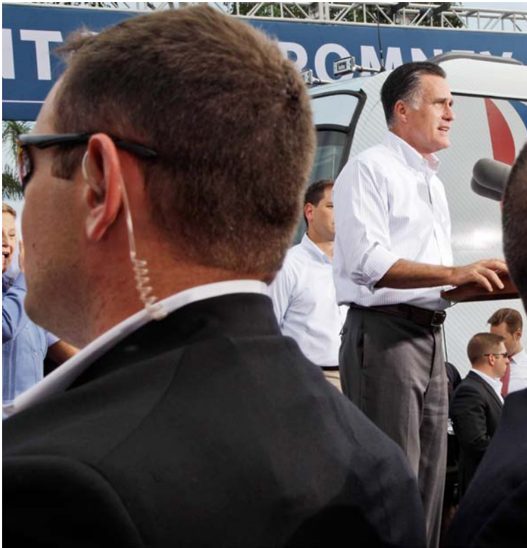
A Secret Service agent guards presidential candidate Mitt Romney at a campaign event in Miami, Florida, on August 13, 2012.

The headquarters of the Secret Service is a plain office building not far from the White House. On the ninth floor, agents work quickly to keep track of the people they are protecting. Besides protecting the president, the Secret Service also guards presidential candidates , officials from other countries, the vice president, and others.