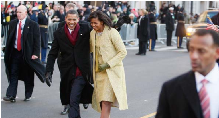
The Obamas walk to the White House on Inauguration Day 2009.