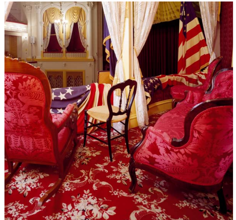
Lincoln was seated in this box at Ford’s Theatre when he was fatally shot by John Wilkes Booth.

Late in the war, Lincoln finally agreed to allow Washington police officers to follow him. Only one bodyguard was on duty when John Wilkes Booth shot Lincoln on April 14, 1865, at Ford’s Theatre in Washington.