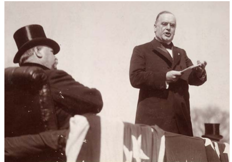
William McKinley delivers a speech during his presidential inauguration.

In 1901, President William McKinley was assassinated in Buffalo, New York. Afterward, Congress asked the Secret Service to protect all future presidents.