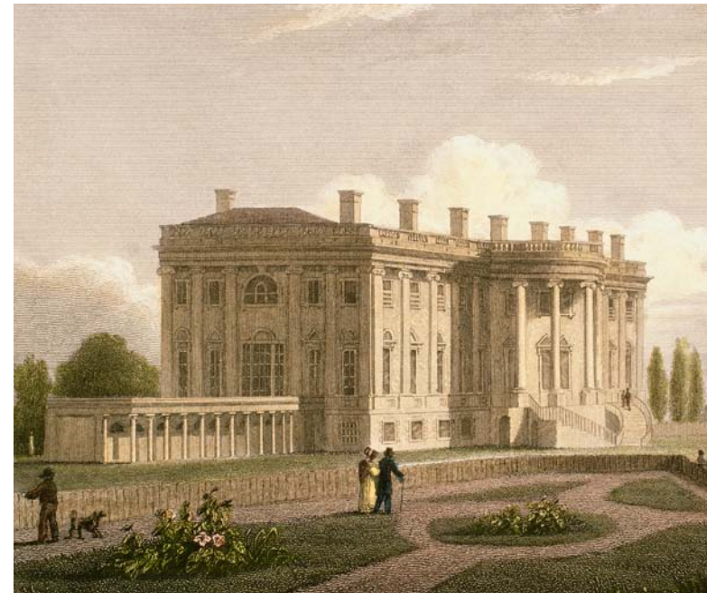
This engraving from around 1850 shows how the White House used to be open to the general public. Today, an iron fence surrounds the building.

If Thomas Jefferson, John Adams, and Andrew Jackson had been alive in 2009, they would have been shocked. In their day, only rulers of foreign countries—not the president of the United States—had bodyguards . In fact, the door to the White House was rarely locked. Anyone could pop in, and many did just that. In the early days of the United States, people came by to chat or to share a cup of tea with the First Lady and president. Others came looking for a job or a special favor.