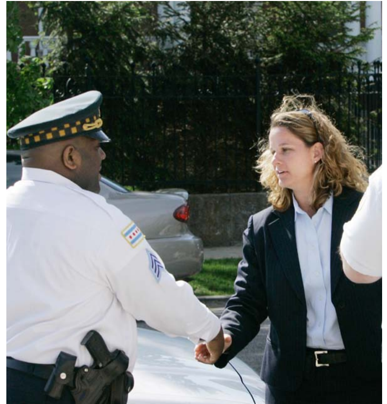
A Secret Service agent greets a Chicago police officer while on assignment.

As the nation grew, so did the threats against the president's life. It became difficult to allow people to freely meet with the president while also making sure the nation's leader was kept safe. Something needed to be done.