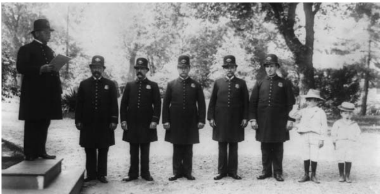
Archie and Quentin, sons of President Theodore Roosevelt, pose for a photo with White House police officers.

It can be difficult to be a child of the president. Their every move is watched. They can't go to the mall whenever they wish like other children or go to their friend's house after school. If they do, the Secret Service has to be nearby. Sometimes kids rebel. Theodore Roosevelt had six children. One son, Quentin, climbed onto the roof of the White House and threw snowballs at Secret Service agents.