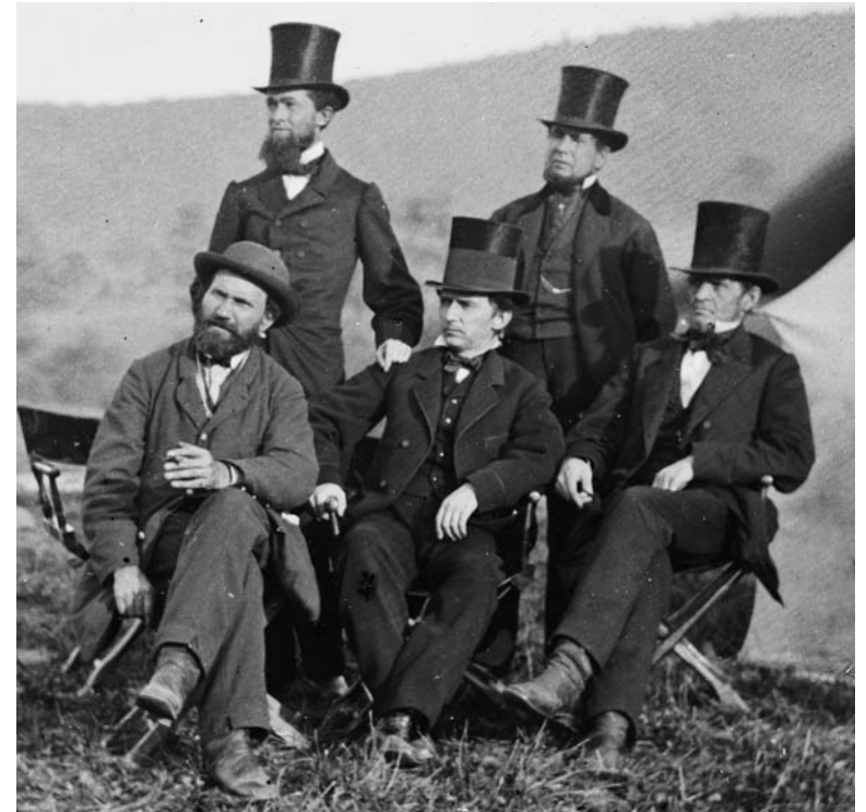
Allan Pinkerton (seated at left) led the Union Intelligence Service during the Civil War. His agents laid the groundwork for the U.S. Secret Service.

The Secret Service becomes part of the Department of Homeland Security following the terrorist attacks of September 11, 2001.