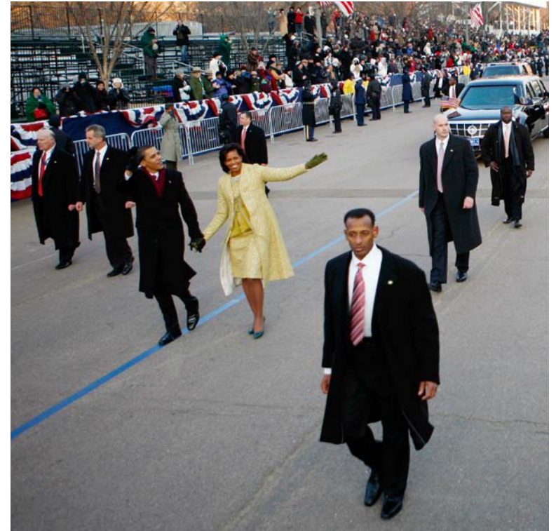
Secret Service agents closed off the streets to provide security during the Obama inauguration.

Even though it was freezing cold outside, the agents had their suit jackets open and their hands close to their hidden weapons. They had sworn an oath to protect the president and had been planning for Inauguration Day for months. The agents left nothing to chance. They had blocked many of Washington's streets and added security checkpoints. Soldiers kept careful watch from the tops of buildings. Fighter jets circled overhead. Boats patrolled the Potomac River.