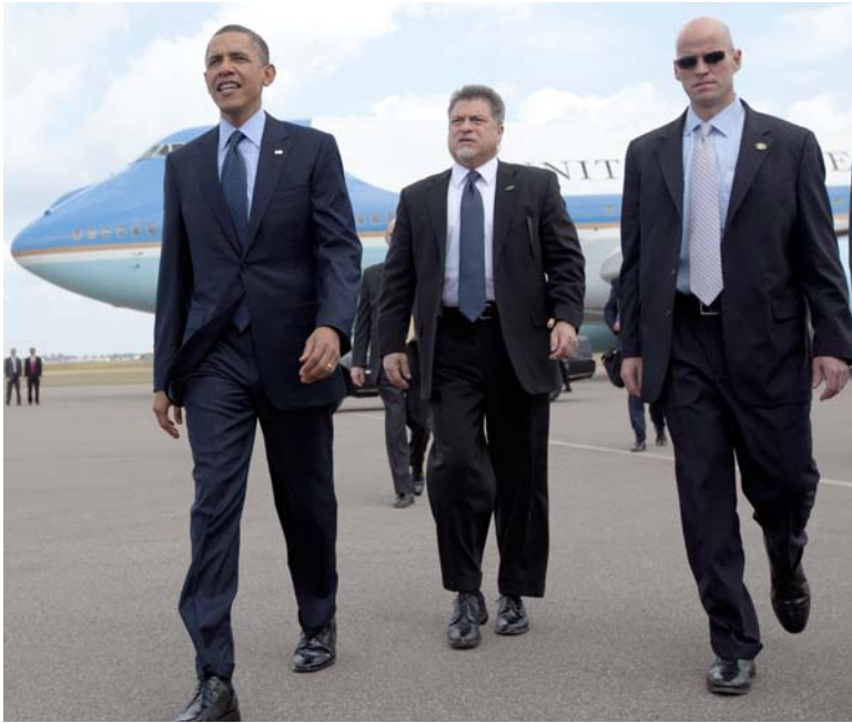
President Barack Obama is flanked by agents after flying to Tampa, Florida, aboard Air Force One.

Why do Secret Service agents keep doing their job if it is so dangerous? It's more than a job. By protecting the president, agents are serving their country. The death of a president can change the course of history. That's why thirty-five Secret Service agents, officers, and other agency workers have given their lives in the line of duty.