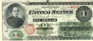
U.S. currency from the Civil War era

Congress creates the Secret Service Division on July 5 to battle counterfeiting of U.S. currency. The agency is part of the U.S. Treasury Department.