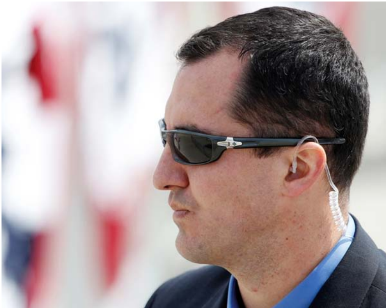
Sunglasses and communications earpieces are often worn by agents on duty.

Agents also wear a tiny speaker in their ear. That's because the Secret Service has its own communication system. The speaker allows agents to hear directions from a special command unit. Agents often look as if they are whispering words into the sleeve of their clothing. Inside the sleeve is a tiny microphone that allows agents to talk to one another.