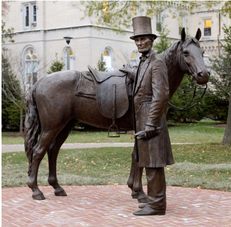
Abraham Lincoln spent his summers at a cottage on the edge of Washington, D.C., and often rode his horse three miles to the White House.

The Secret Service began its work three months after Abraham Lincoln was assassinated . Lincoln was president during the Civil War (1861–1865). At the time, many Southern states wanted to leave the Union. The capital city of Washington was full of thieves and plotters. Many people wanted Lincoln dead. Some tried to kidnap him. Others took shots at him. A musket ball knocked Lincoln’s hat off his head one day when he was riding a horse along a country road.