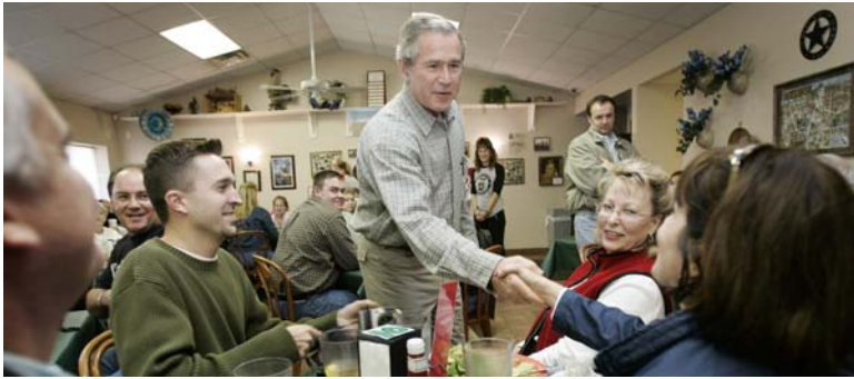
President George W. Bush greets local people at a diner in Crawford, Texas, in 2004.

Why were these early presidents so easy to meet with? The United States was founded as a democracy . Americans didn't want to be ruled by a king or queen who just happened to be born into a royal family. Instead, Americans wanted to choose their own leaders through elections. Presidents had to listen to the wishes of voters if they wanted to keep their jobs.