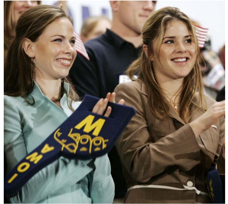
Barbara and Jenna Bush sometimes grew tired of Secret Service protection.

All day, agents stuck close to the first couple as the Obamas made their way from the inaugural parade to dances and balls. Nothing bad happened. That's the way it was supposed to be. The planning and hard work of the Secret Service had paid off. It was all in a day's work.