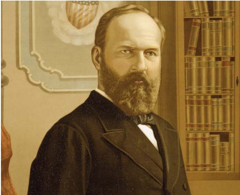
James Garfield was president for only two hundred days before his assassination rocked the nation.