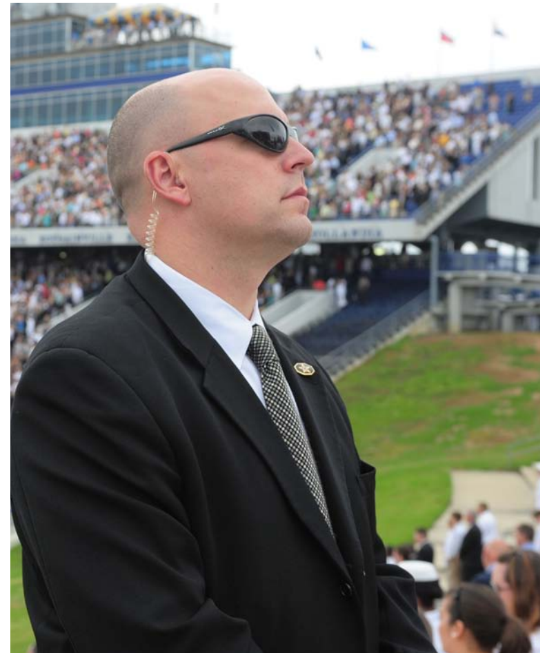
A Secret Service agent stands guard at a football stadium.

The agency also gives protection at special events, including the Olympic Games and the Super Bowl. Every day, the Secret Service learns of new threats against the people they are protecting, including the president. The threats can come over the telephone, in the mail, or over the Internet.