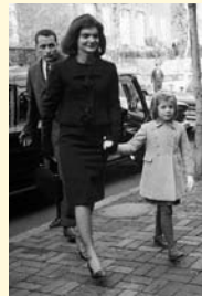
Jacqueline and Caroline Kennedy

Congress allows the Secret Service to protect former presidents and their spouses.